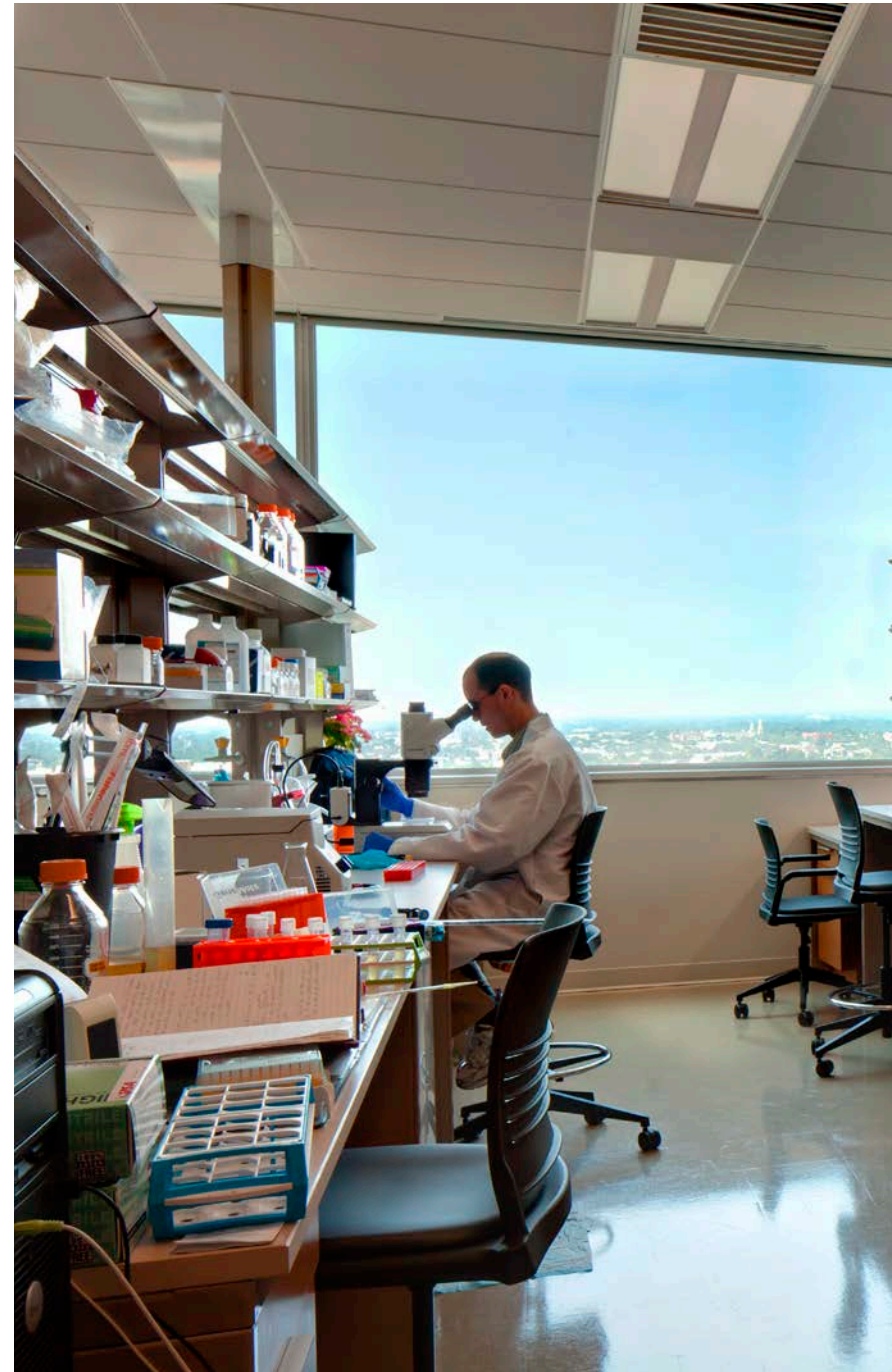
Smilow Center for Translational Research

These projects are designed to enhance the collaborative process and exchange of ideas, and further drive the future of Penn's leading research and innovation.