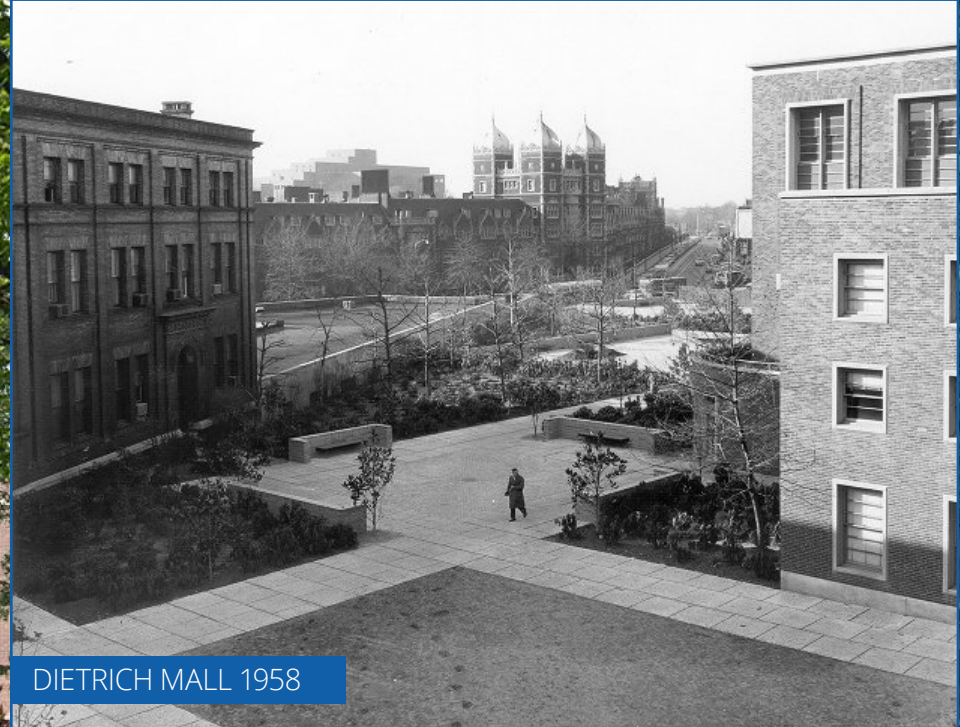
DIETRICH MALL 1958