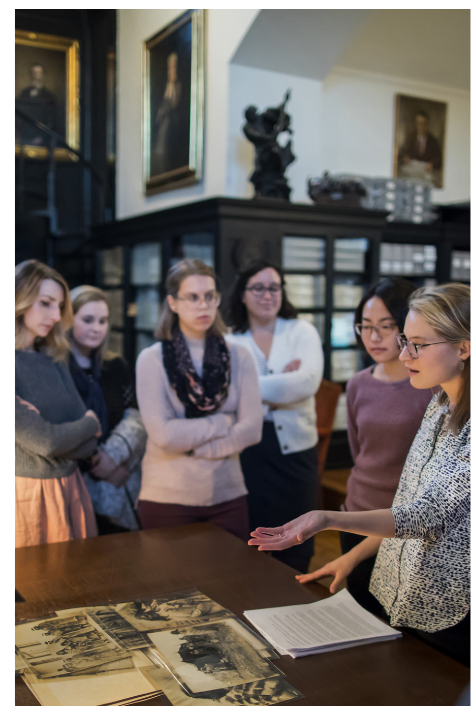
Art History curatorial seminar at Museum Archives

Penn Connects 3.0 enhances the compact and walkable nature of the campus by locating several new academic and research projects within the core of the University. These projects will encourage different teaching pedagogies and enhance learning.